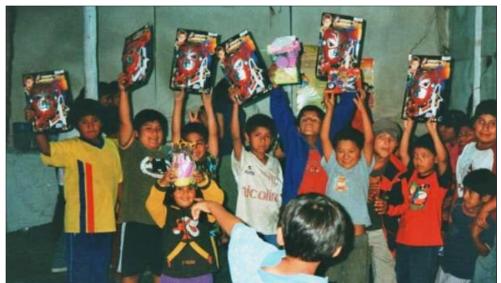
Children happily displaying the gifts they received at one of the Christmas Choclotadas.